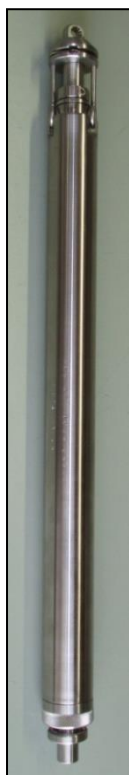
ALS 542 Spot Sampler