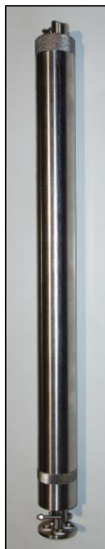
BTMS 302 Bottom Sampler