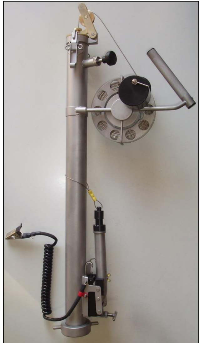
MK 2 Winder with MMC type valves (coupling available to suit)

The winder includes a gear-driven depth counter, to give the operator a clear indication of the depth of the sampler at all times throughout the sampling process. It also has a built-in emptying system, so that the sample can be transferred directly into a collecting bottle, without the need to remove the sampler from the winder, giving speedy transfer of the sample, with no mess on the deck!