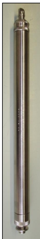
RNS 542 Running Sampler