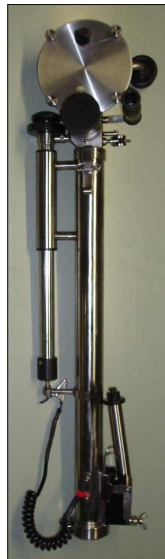
MK 7 Winder with MMC type coupling (alternative coupling available to suit)

Reliability is a key feature of our sampling equipment that helps to avoid repetitive sampling, saving time and money.