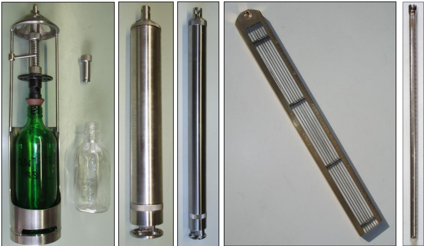
ALSB-V 1002 (1L) All-Level & Spot Sampler