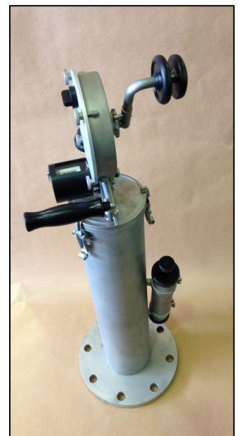
Main tube, showing vacuum pump and support strut