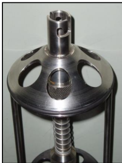
'Bayonet' type hook