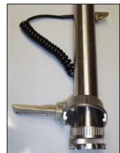
Alternative coupling available - Tank Systems Type

The range of sampling equipment included in this system, for use with the MK 2/2 winder, offers representative samples under safe conditions saving time and money.