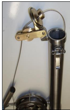
Top valve open