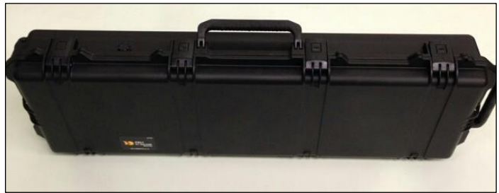
Storm Proof Transit Case