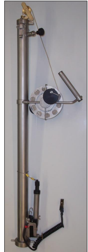
MK 2/2 Winder with MMC Type 2-inch coupling

The winder also has a built-in emptying system, so that the sample can be transferred directly into a collecting bottle, without the need to remove the sampler from the winder, giving speedy transfer of the sample, with no mess on the deck!