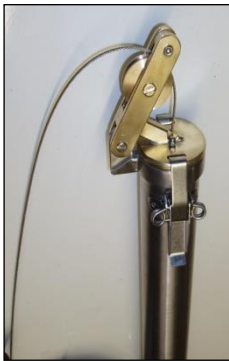
Top valve closed