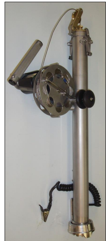
Winder MK 2, with Depth Counter & UTI type coupling

Please contact us if you require further information about these or other equipment offered by UK Sampling Gauges Ltd , or if you require equipment to be adapted or modified.