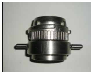
Adaptor for MMC type valves