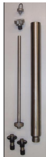
RNS 402 S Sampler Components