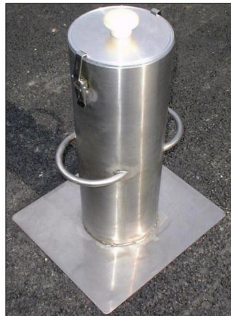
Cooling Drum (Optional)