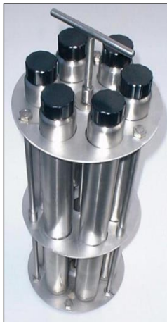
Carrying Cradle with 6 cans (12 – 18 cans per vessel may be required)