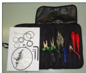
Maintenance Repair Kit