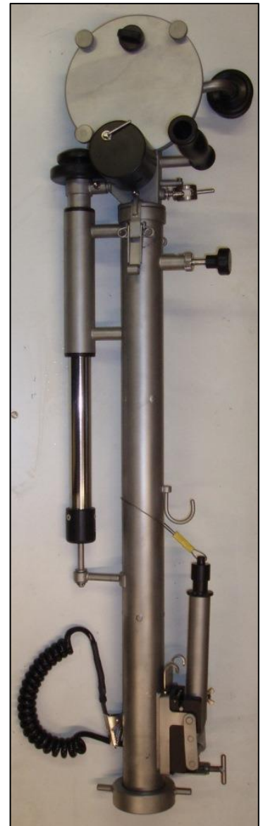
MK 7 Winder with MMC type coupling (alternative coupling available to suit)

Reliability is a key feature of our sampling equipment that helps to avoid repetitive sampling, saving time and money.