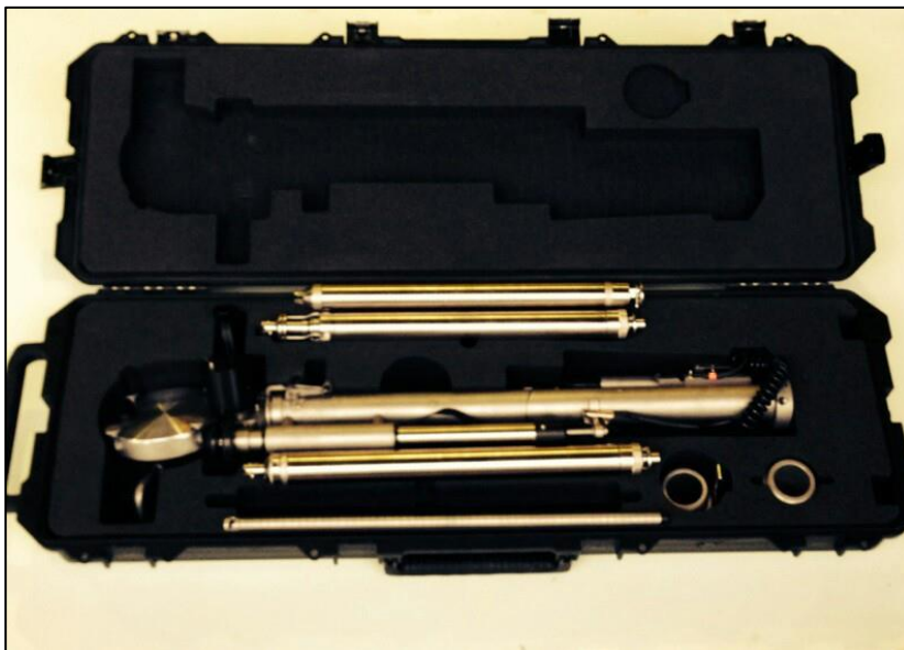
The complete kit in its storage/transit case