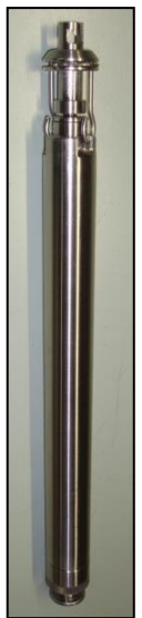
ALS 542 Spot Sampler