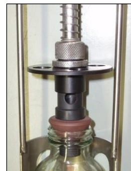
All-level Sampling: Inlet valve set to maximum opening (for viscous oils)

Please contact us if you require further information about these or other equipment offered by UK Sampling Gauges Ltd , or if you require equipment to be adapted or modified.