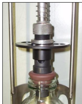
All-level Sampling: Inlet valve set to minimum opening (for light products)