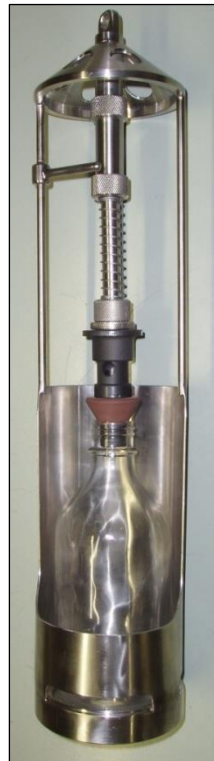
Running sampler set-up