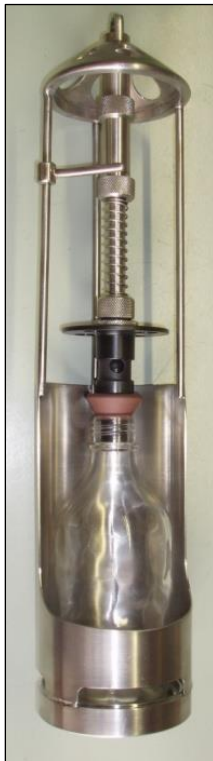
All-level sampler set-up