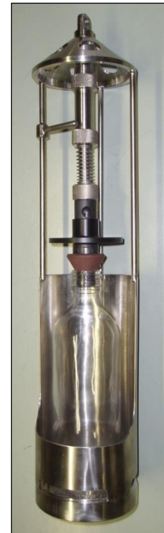
Spot sampler set-up