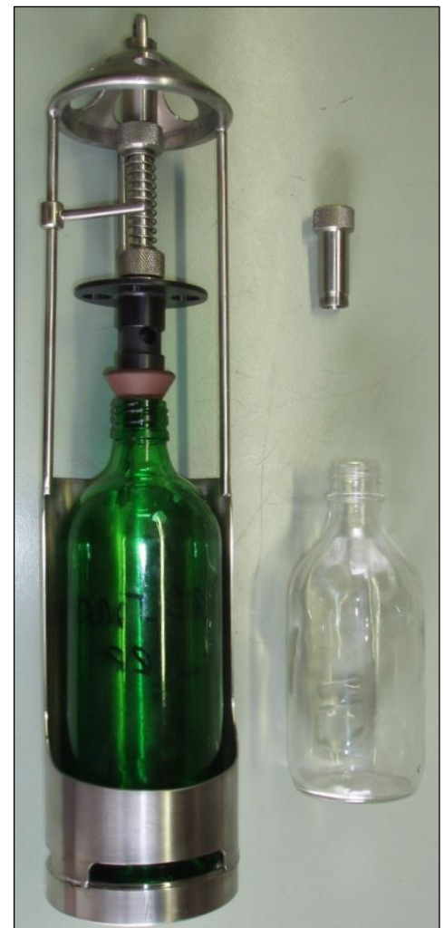
ALSB-V 1002, 1-litre & 500 ml bottles and showing short bottle adaptor

Fitting and removing bottles is quick and easy and many different bottle types can be accommodated.